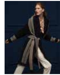
CARDIGAN XT19FW859 BLOUSE XT19FW415 TROUSERS XT19FW626