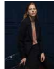
JACKET XT19FW522 TOP XT19FW446 TROUSERS XT19FW523