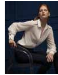
BLOUSE XT19FW465 TROUSERS XT19FW524