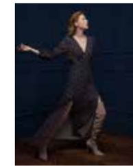
LONG DRESS XT19FW572