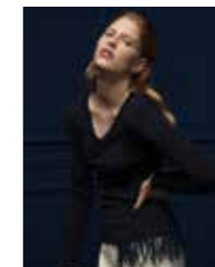
SWEATER XT19FW815 TROUSERS XT19FW626