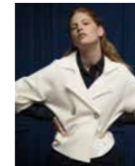
JACKET XT19FW852 BLOUSE XT19FW453