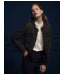
JACKET XT19FW453 BLOUSE XT19FW466 TROUSERS XT19FW523